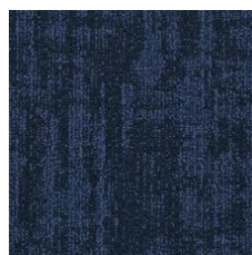
Clear 67486 LRV 5