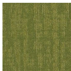
Brilliant 67325 LRV 17.7