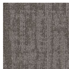
Interaction 67515 LRV 18.1