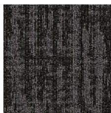
System 67505 LRV 5.5