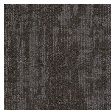
Link 67555 LRV 8.2