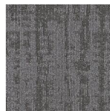
Network 67535 LRV 14.5