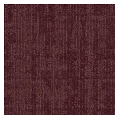
Dynamic 67850 LRV 6.1