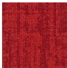
Radiant 67855 LRV 8.7